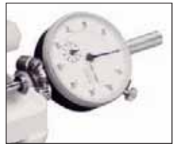
Q485 Dial Indicator for ultra fine flow adjustment Price: (pg 28 for more info)

Can't decide? Call us, we have the answers.